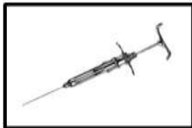
Sharing needles and other drug taking equipment